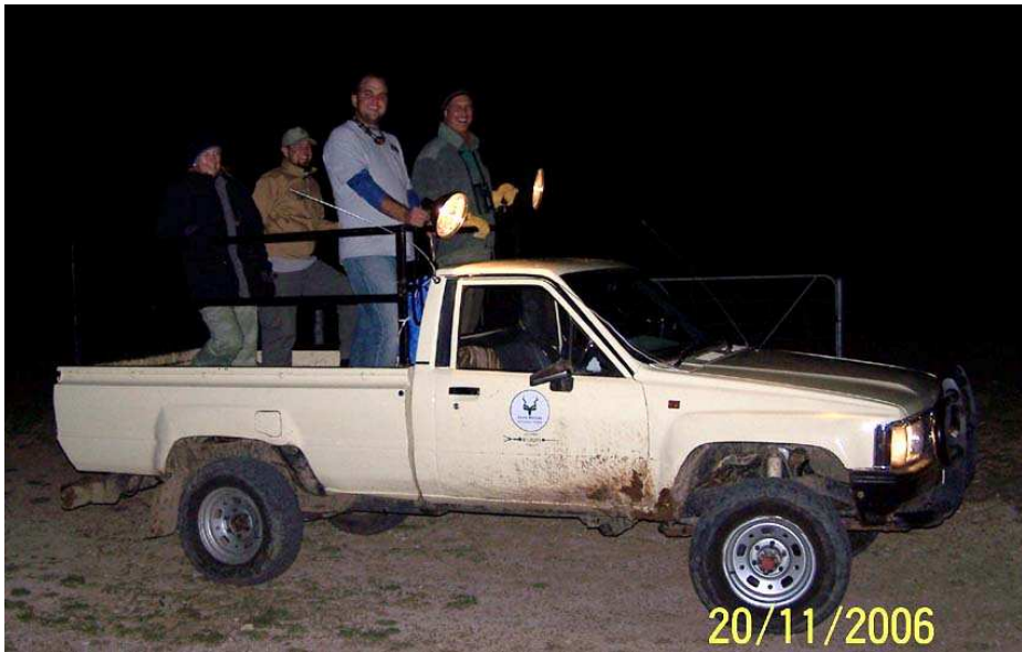
Fig.3. Setup for spotlighting and chasing.