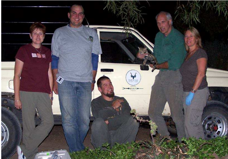
Fig.5. Posing with cat.