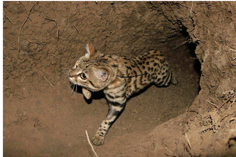
Fig. 9. Male cat 4 “Panga” runs from den – radio-collar antenna visible.