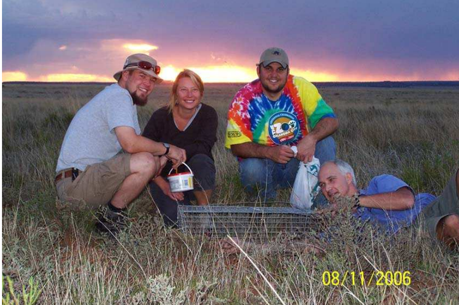
Fig.1. Setting traps at sunset