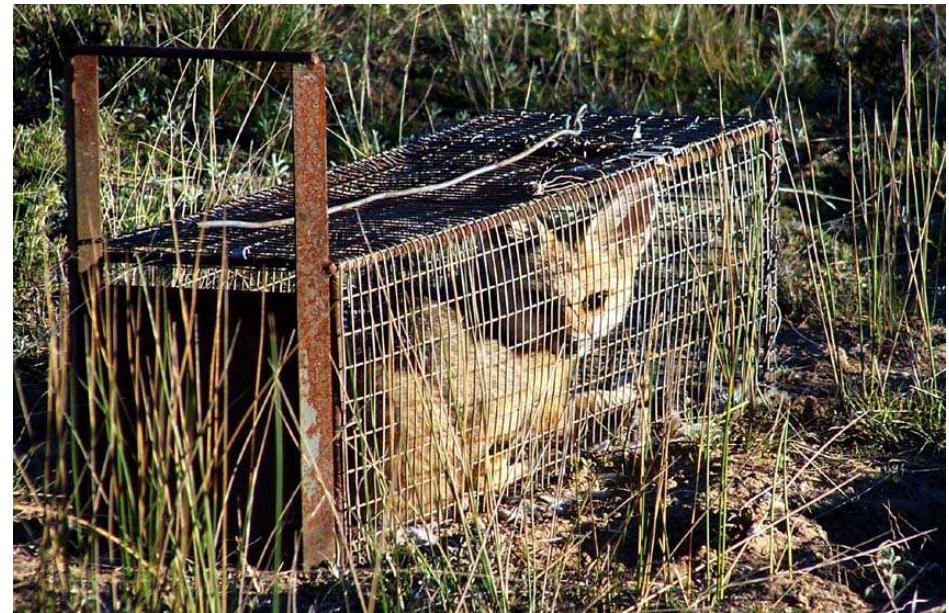
Fig.2. Cape Fox in the trap