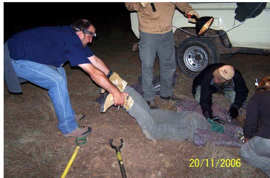
Fig.4. Extracting human with anesthetized cat from hole.