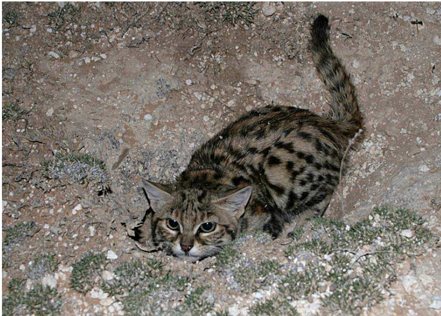
Fig. 8. Male cat 2 leaves the den