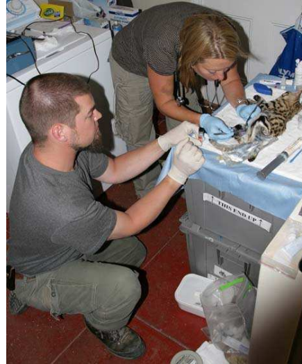
Fig.6. Taking a fat sample